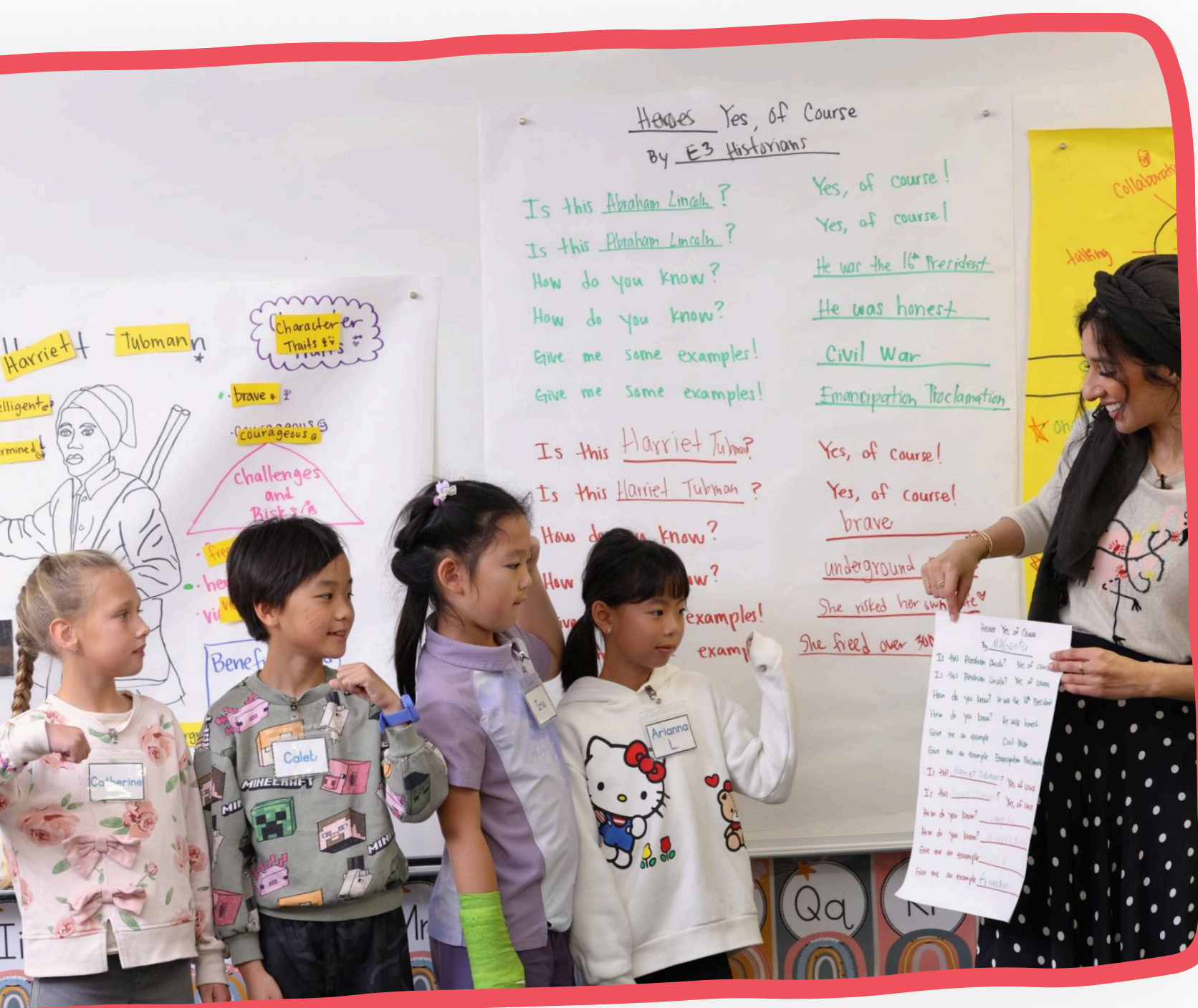
Sustainable strategies that build confident, engaged learners.

Visit www.begladtraining.com or email us at hello@begladtraining.com to learn more.