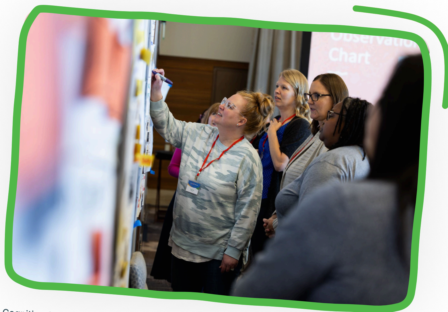
Cognitive Coaching helps teachers deepen and refine Be GLAD® strategies.