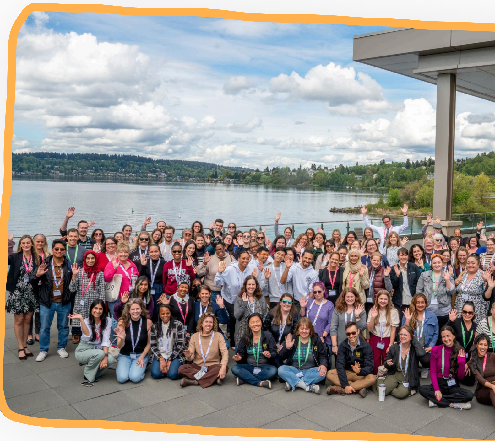
CAT Program graduates lead Be GLAD® training and implementation.