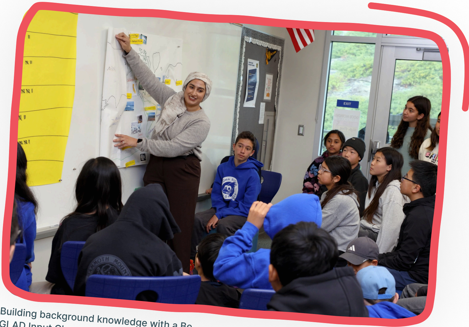
Building background knowledge with a Be GLAD Input Chart.