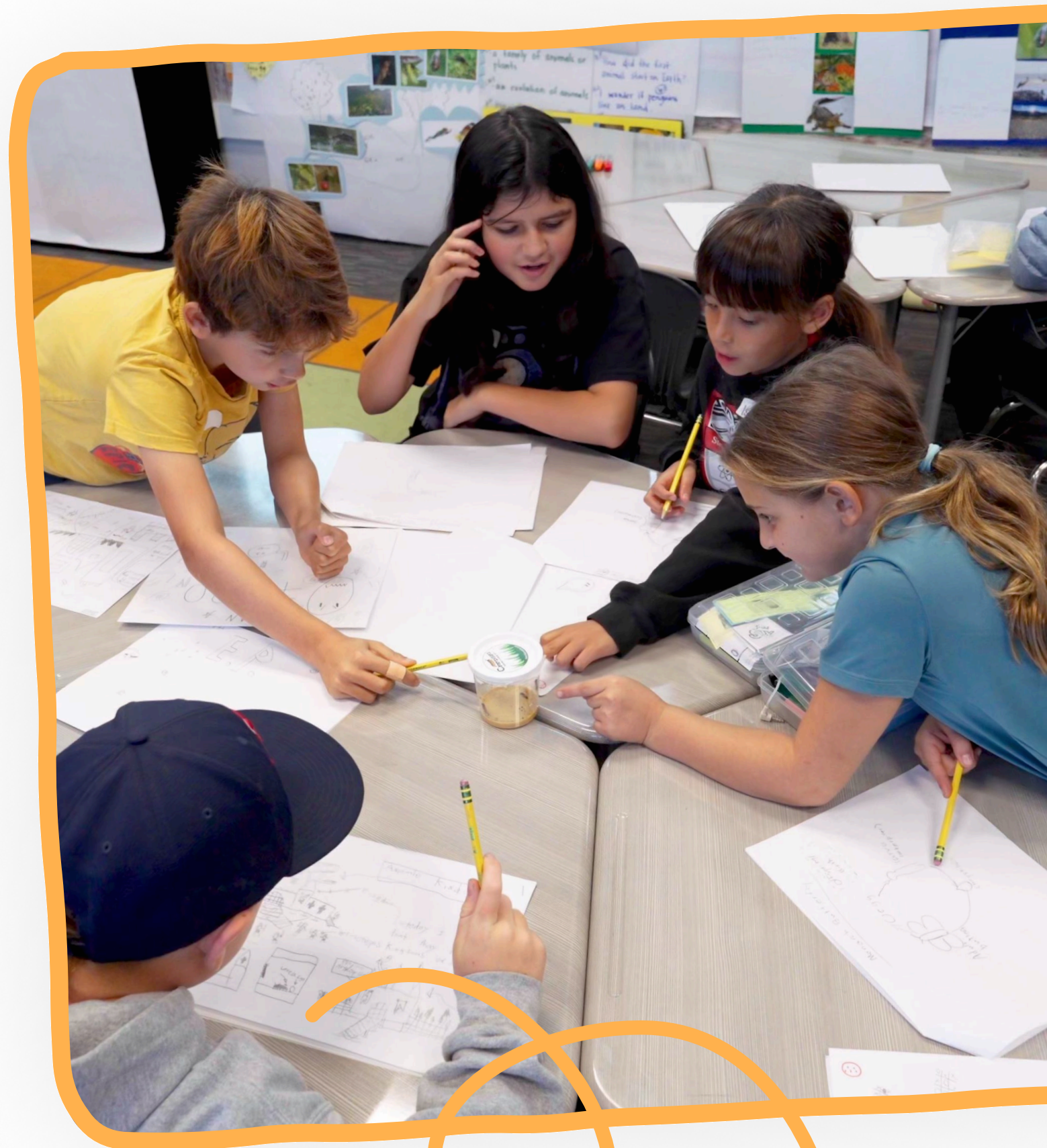
Collaboration and language in action with Be GLAD®.