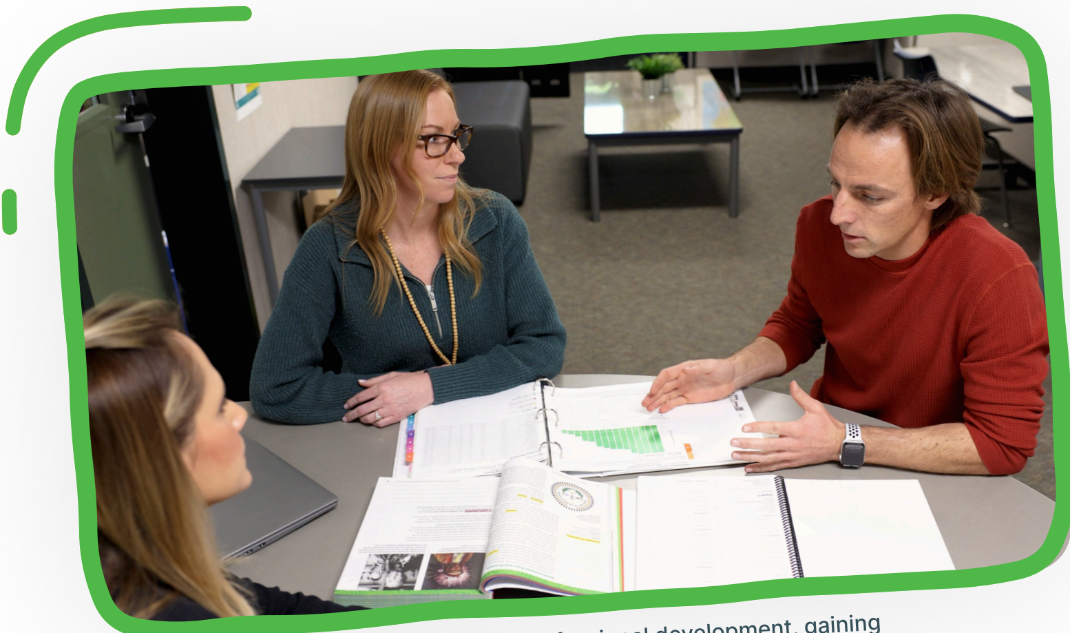
Educators collaborate during Be GLAD® professional development, gaining practical, research-based strategies to support multilingual learners.