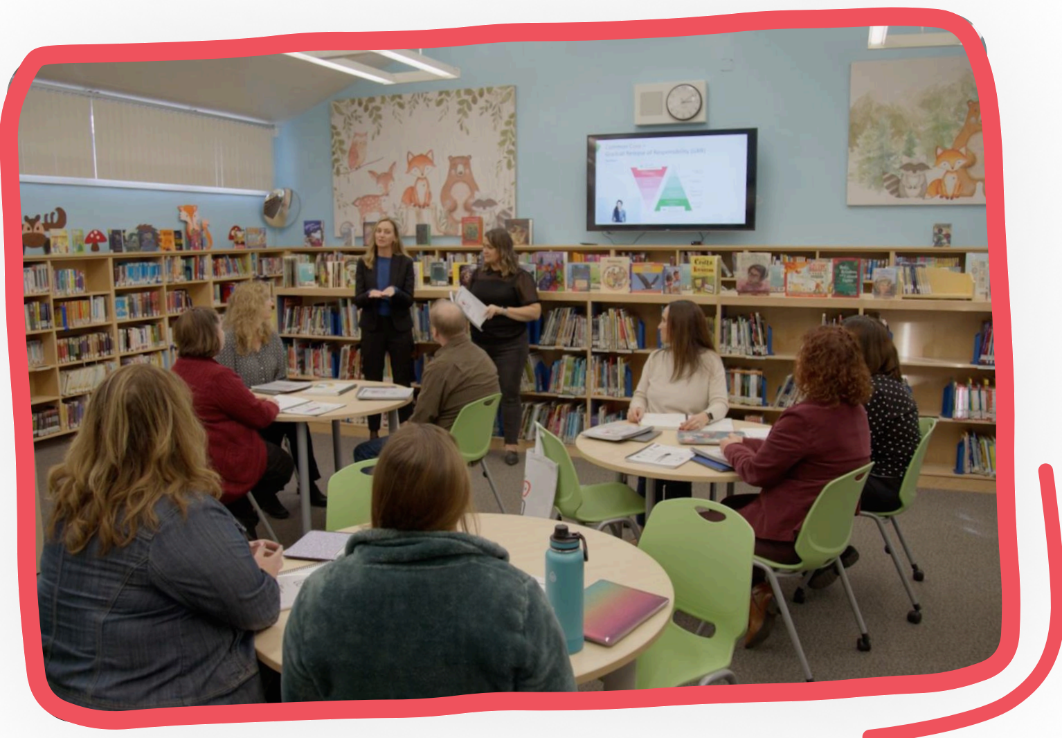
Be GLAD® training equips educators with practical, research-based strategies.

Teachers gain tools they can implement immediately through modeling, classroom demonstrations, and downloadable resources.