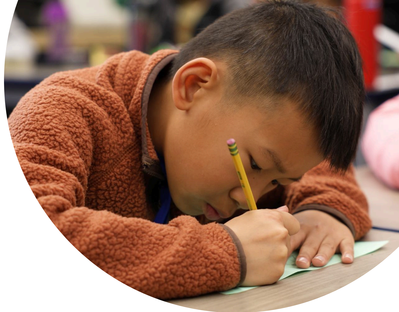
Be GLAD® fosters lasting student success.

Schools consistently report improved student outcomes, increased teacher retention, and stronger instructional alignment - all from one cohesive system.