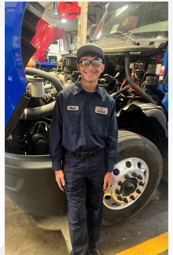
ON THE JOB LEARNING