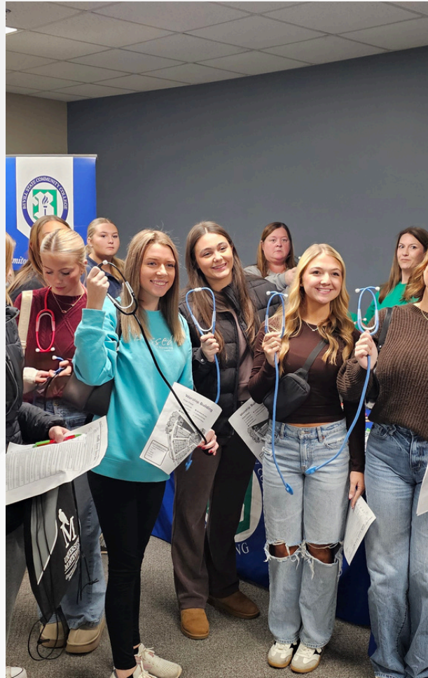
HEALTH SCIENCE CAREER FAIR