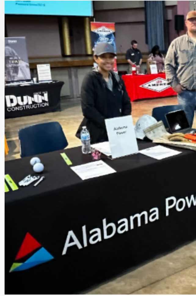
INDUSTRY CONNECTION DAY