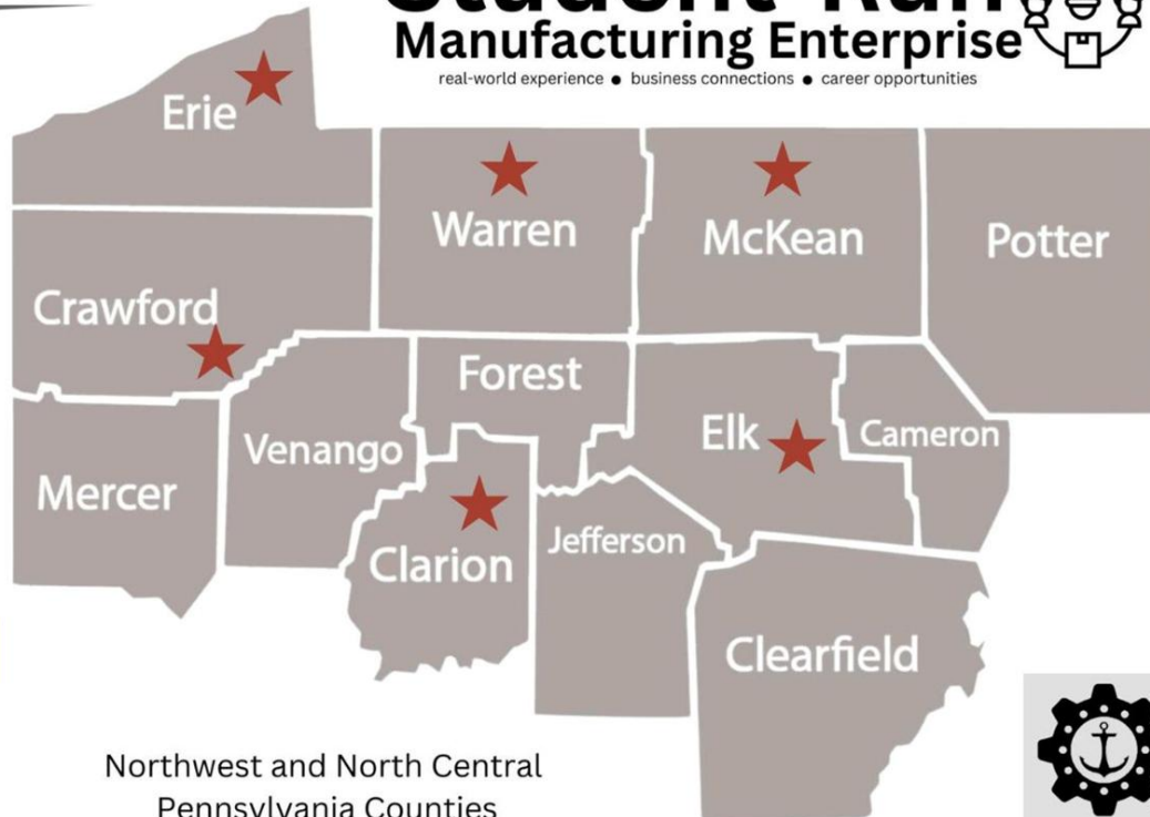
Northwest and North Central Pennsylvania Counties