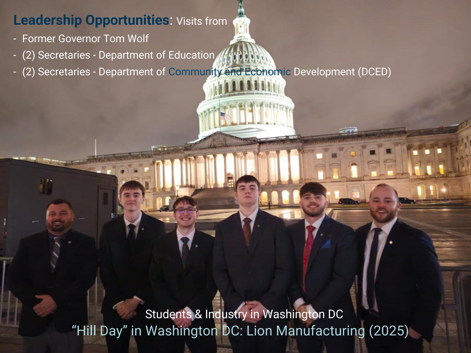
Students & Industry in Washington DC “Hill Day” in Washington DC: Lion Manufacturing (2025)