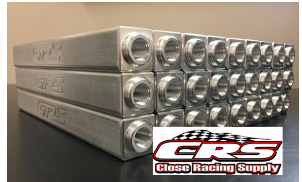
Aluminum Control Arm Link