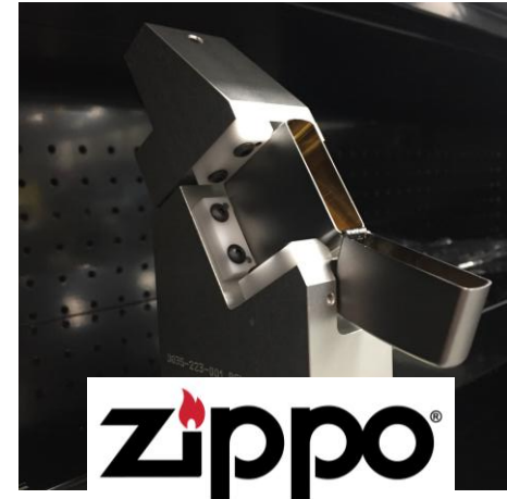
White Delrin Jaw Blocks