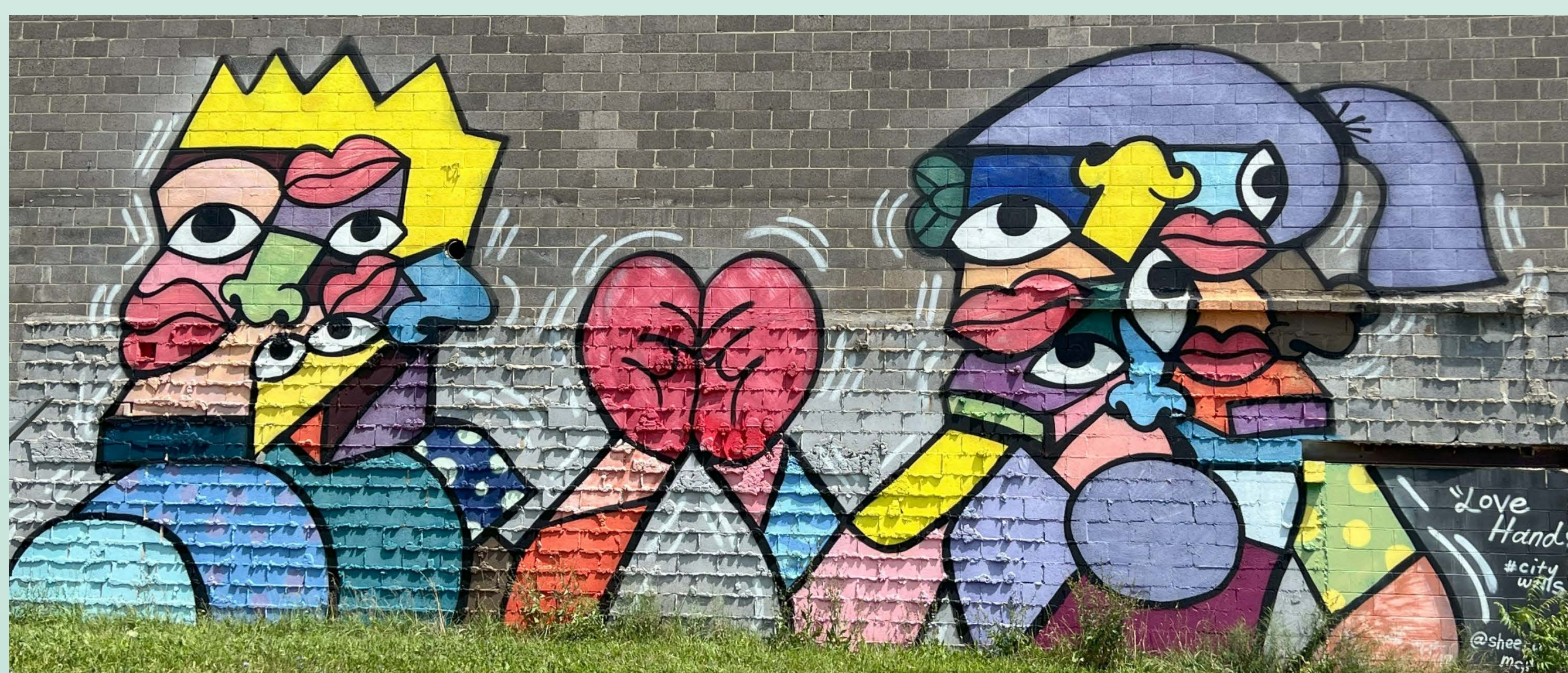
Tashif Turner (Sheefy). (2019). Love hands . 13133 Gratiot Ave, Detroit, MI

This small-scale exploratory study of Dublin Core metadata was undertaken using images of 18 murals classified into three mural types: abstract, textual, representational and two mural groups (A and B). Two participants utilized two workflows consisting of human-only metadata creation and Google Lens-assisted metadata creation. Each participant worked through the 18 murals individually with the two mural groups being reversed for each participant. Each mural and mural type included in the study was cataloged once using both methods. All Google Lens provided information statements were verified by the participants using external authoritative sources. Data were collected which examined: time to completion, accuracy, terminological richness, authorized vocabulary, cataloger confidence, and challenges encountered. Data were analyzed using descriptive statistics and thematic analysis.