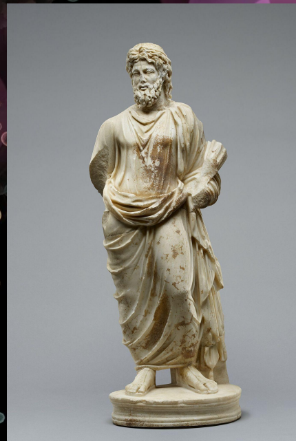
Left: Ploutonion Temple at Hierapolis (Pamukkale, Turkey). Center: Kylix, 430 BCE (British Museum). Right: Roman statue of Plouton, 1st century CE (Getty Villa Museum).