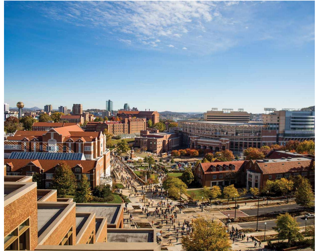
UTK Campus Pedwalk Bridge - https://brand.utk.edu/standards/photography/