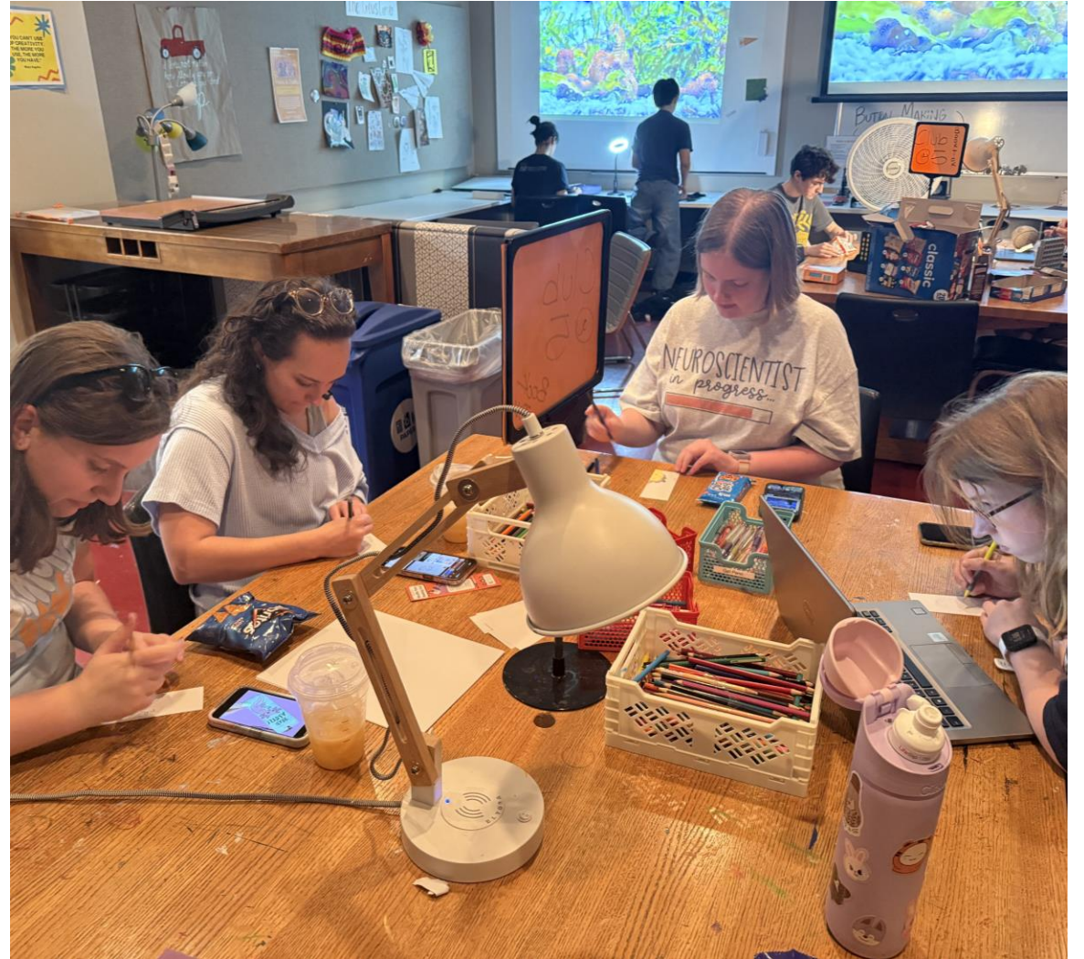
Photo of book club end of year bookmark making craft