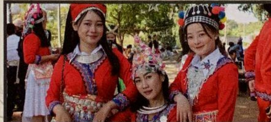
Background for Teachers